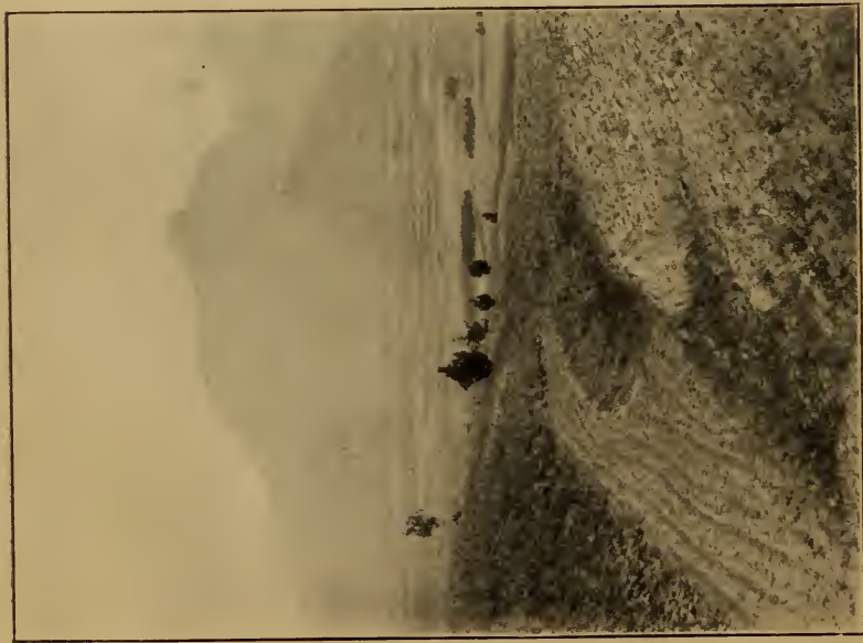
THE WORLD'S OLDEST SACRED MOUNTAIN, T'AI SHAN.